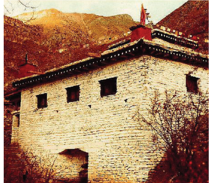
The "Temple Of Miraculous Fire" at Muktinath, Nepal.